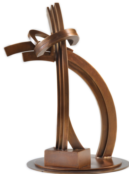
Figure 1: From The Frostig Collection Guy Dill

Cover Image: From The Frostig Collection Nancy Rubins