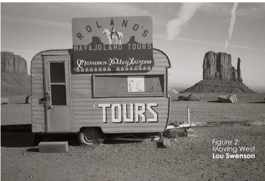
Figure 2: Moving West Lou Swenson

Swenson's expertise in maximizing tonal variations, textures and shadow patterns across the landscapes and architecture he shoots lies in photographing and printing black and white silver halide negatives in his home darkroom, a practice he continues as long as film, paper and chemicals are available. His works are sensuous and striking homages to the beauty of the west, where artists still come to capture the dramatic landscapes and cultural heritage found in this quiet part of the world.