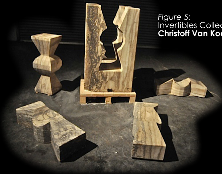
Figure 5: Invertibles Collection Christoff Van Kooning

His objective is to release a lively series of shapes from the original material through a process of discovery.